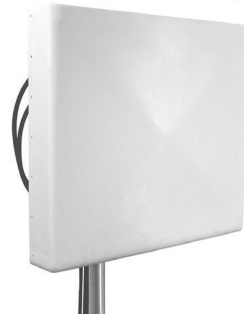
698-960MHz & 1710-2700 MHz Directional Panel Antenna