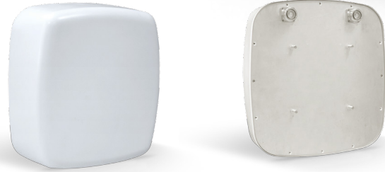
698-960MHz, 1695-2700 MHz, Directional Panel Antenna